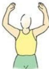
Arm slides on wall